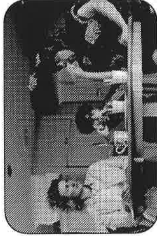
GERM GUY: Mmmm!