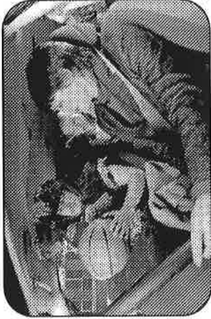
GERM GUY, KIDS: Ew. ANNCR: When germs wear you down all day...