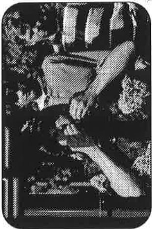
GERM GUY: Careful it's slippery!