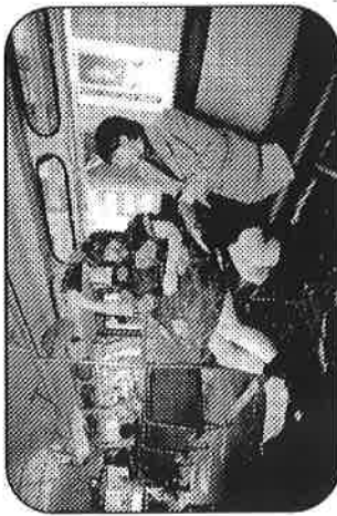
GERM GUY: Hello. Oh. Oh. (Sneezes)