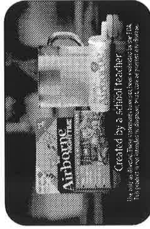
...plus natural herbs that can help you get a good night's rest and stay healthy.