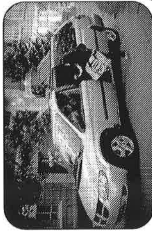
MOM: Hey guys. GERM GUY: (Laughs) (sneezes)