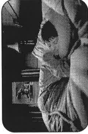
ANNCR: Have you taken your Airborne? GERM GUY: Hello?