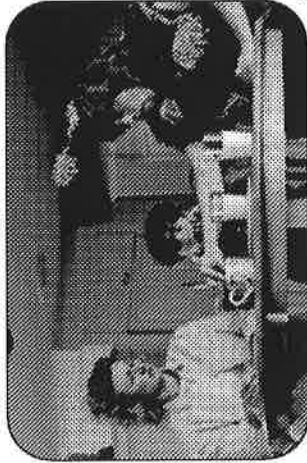
and they love to meet parents.