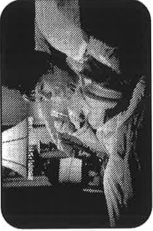
...take Airborne Nighttime. All the immune-boosting benefits...