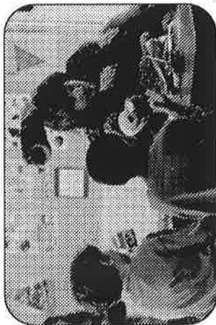
GERM GUY: There ya go.