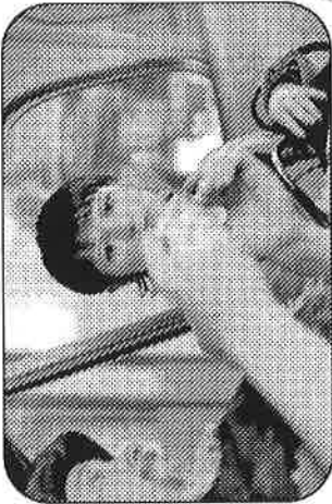
GERM GUY: Do you have change?