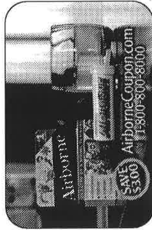
ANNCR: Save now at Airbornecoupon.com