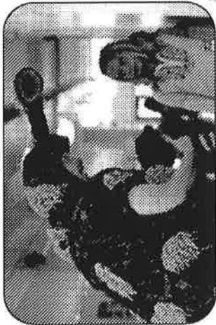
GERM GUY: (Sneezes) Did you see that?