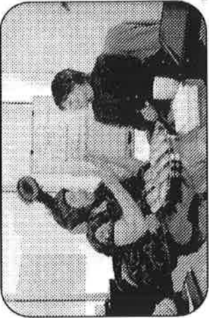
GERM GUY: These look good, huh? Would you like uh, cinnamon or blueberry?