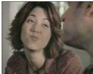
WOMAN: Hmm. (SFX OUT) (MUSIC RESUMES) ANNCR: For a fresh way to eat better,