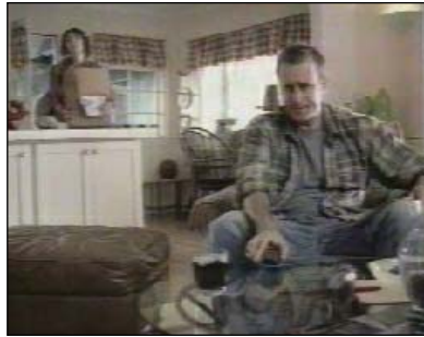
MAN: Hey, honey. WOMAN: Hey. Remember how we talked about eating better?