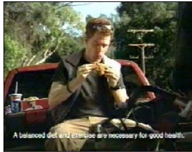
MALE ANNCR: The secret's out.