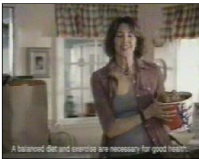
Well, it starts today.