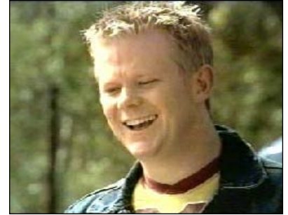
Man, you look fantastic. What the heck you've been doing?