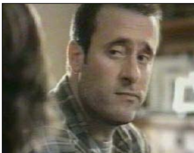
(SFX RESUMES) MAN: You know, I'm doing this for you.