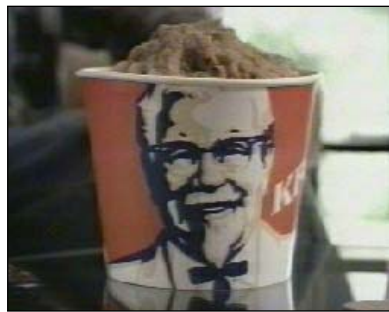
(SFX PAUSES) (MUSIC IN) MALE ANNCR: The secret's out,