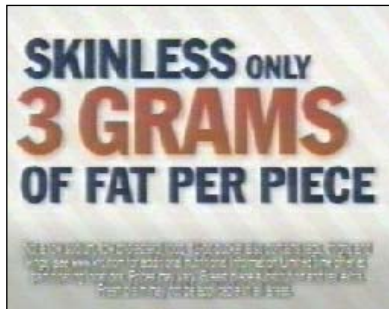
three grams of fat per piece.