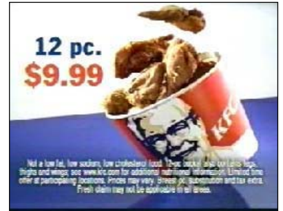
And now, get a 12-piece bucket of kitchen-fresh chicken for just 9.99.