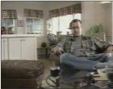
(SFX: TV/BALL GAME)

LENGTH 30 STATION WBZ DATE 10/27/2003 TIME 05:57 AM