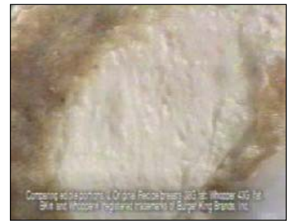
two Original Recipe Chicken breasts have