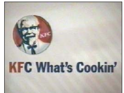
you've gotta KFC what's cookin'. (MUSIC OUT)