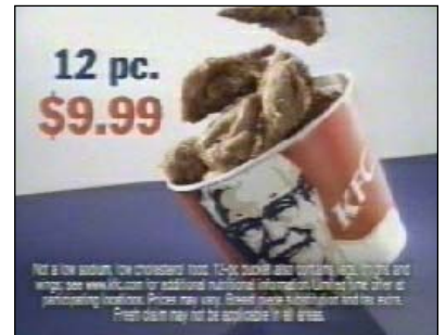
And now, get a 12-piece bucket of kitchen fresh chicken for just 9.99. (MUSIC PAUSES)