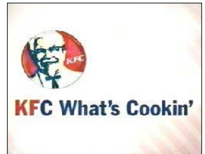
ANNCR: For a fresh way to eat better, you gotta KFC What's Cookin'. (MUSIC/OUT)