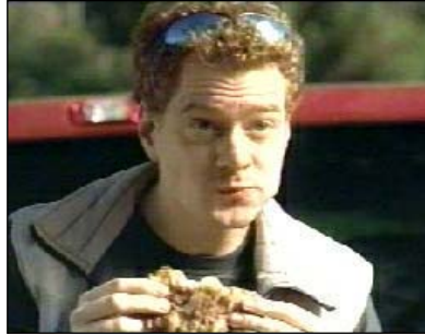
is that you?