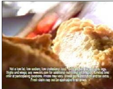
So, if you're watching carbs and going high protein, go KFC.