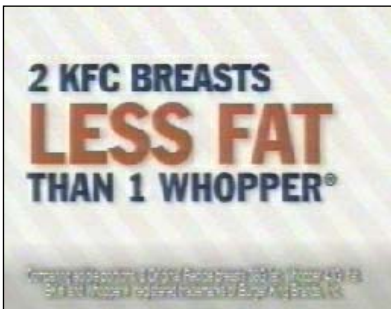
less fat than a BK Whopper. Or go skinless for just