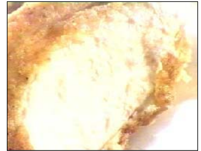
One Original Recipe Chicken Breast